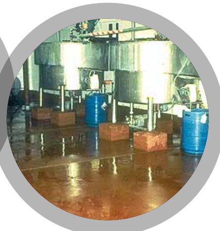
Machinery Production Areas