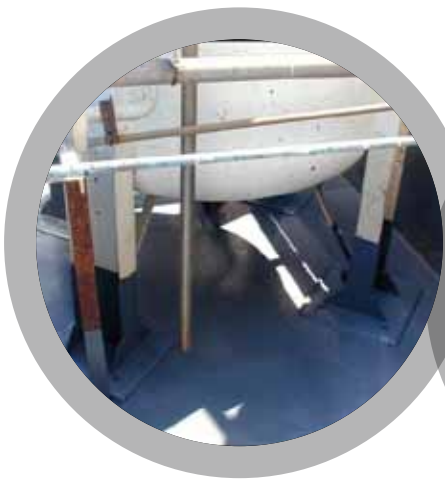
Chemical Containment Areas