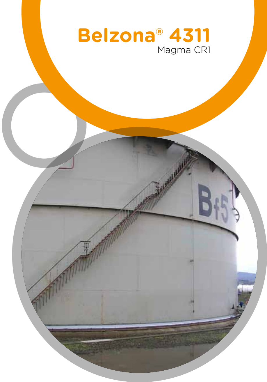
Chemical Storage Tanks

For more information, please contact your local Belzona representative.