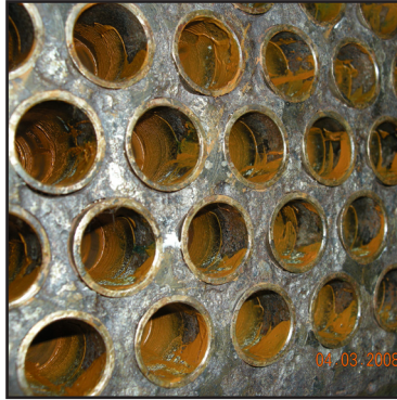
Close up of erosion on tubesheet