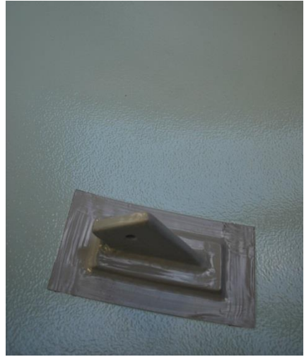
Belzona 1523 and Belzona 1593 completed application