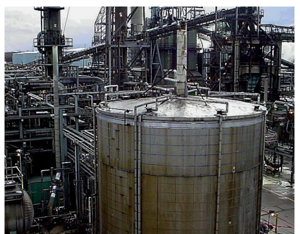
Sulfur Storage Tank

Sulfur storage tank failures cannot not only lead to loss of revenue and increased costs through downtime and replacement, but can also have a critical human health and environmental impact. Due to the combustible and toxic nature of sulfur, leaking sulfur tanks can be a significant source of environmental pollution to soil, groundwater, streams and lakes, resulting in contamination of drinking water. In addition, fire, explosion and inhalation of dangerous vapors present further critical concerns. Such scenarios may result in asset owners facing strict financial penalties from environmental regulatory institutions and as a result, damage their reputation on a local and international level.