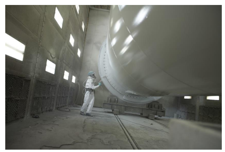
Hazardous spraying applications require correct protection, including respirator

Following reaction to form the hardened or cured polyurethane product, isocyanates are no longer active and therefore, pose no harm. Therefore, the potential for exposure comes during the application process, with isocyanates posing significant risk during spray application. Spray application generates a mist which can be readily inhaled and can lead to respiratory sensitisation or occupational asthma. As a result, it is important to ensure adequate protection when handling these materials, such as adequate personal protective equipment.