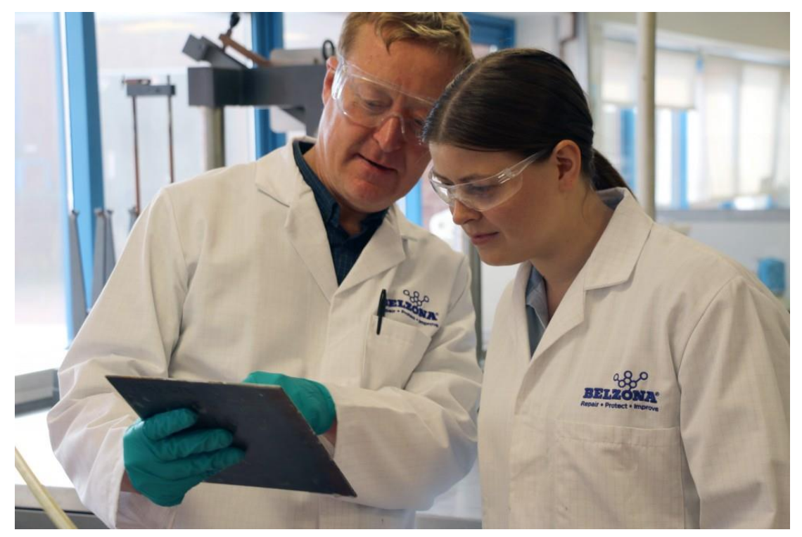
Belzona is proactive in eliminating hazardous substances from their materials