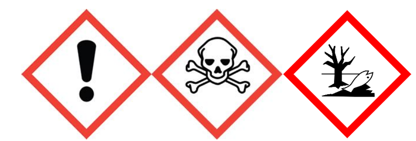
Improved hazard labelling indicates what is harmful, toxic and damaging to the environment

Hazardous chemicals can pose substantial problems for both the environment and human health; therefore, improved management procedures and preventive policies are required to monitor the use of these substances. This includes strengthening the existing controls and responsibilities surrounding hazardous chemicals and formulating materials with less harmful chemicals during design, production and application phases.