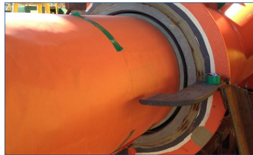
Riser inserted into housing