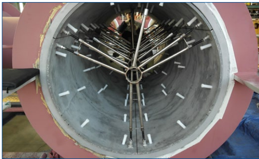
Fitting bearing to housing

As the bearings reached 2.5m diameter and 3m length, they were split into up to 16 sections and had to be bonded in place. The bearings were aligned in place using jigs, straps and injection port bolts. The bearing had to be jacked to 4mm from the substrate and the seams were then dammed using Belzona 1111 (Super Metal) . Belzona 1321 (Ceramic S-Metal) was injected through the injection ports. After curing the injection ports were cut off, filled with Belzona 1111 , and ground flush. The application is part of a substantial project, which represents the largest discovery of hydrocarbon liquids in Australia in 40 years. ■