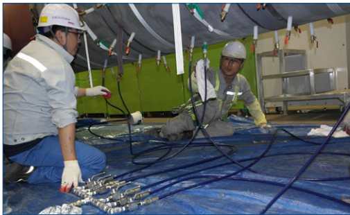
Injecting Belzona 1321