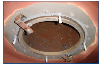
Rudder bearing installation