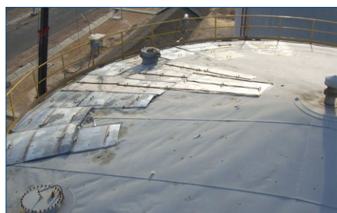
Plates bonded with Belzona