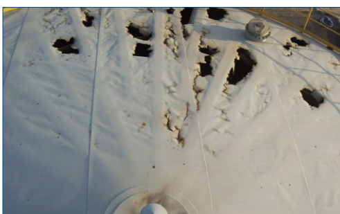
Holed tank roof

Residual stresses caused by uneven expansion-contraction change the structure and the properties of the metal and can lead to potential material degradation. ▶▶