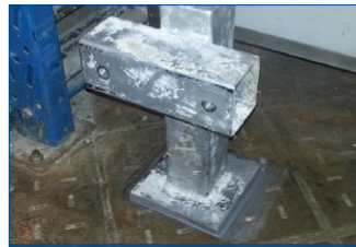
Load bearing shim creation