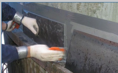
Tank base repair