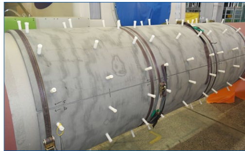
Fitting bearing to riser