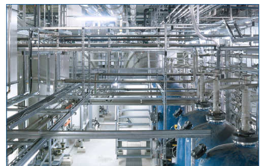
Belzona 1221 can be used for the permanent bonding, repairing or rebuilding of PE and PP substrates