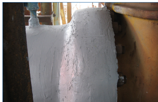
Belzona 1161 (Super UW-Metal) flange sealing