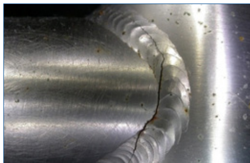
Fig 2: Stress cracking on a weld