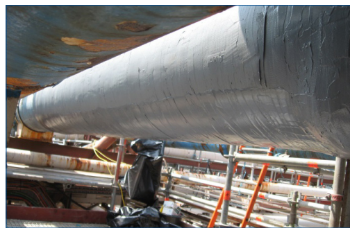
Belzona 4301 (CR1) for chemical resistance