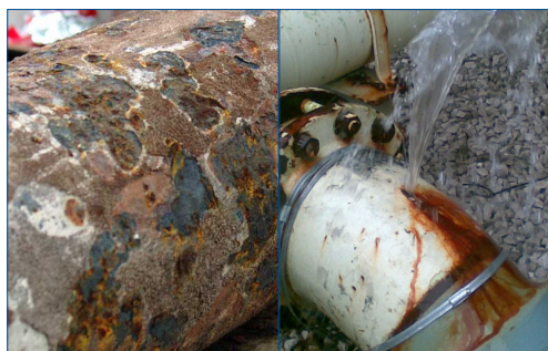
Fig 1: Erosion, corrosion and pitting damage Through wall damage resulting in leaks

Epoxies are convenient materials to be used as they have outstanding adhesion and excellent mechanical properties compared to other non-metallic systems such as polyurethane, methacrylate, alkyd, vinyl and polyester-based polymers. ▶▶