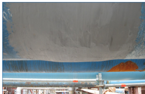
Temporary wrap to holed area