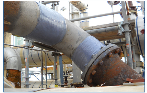
Thin-wall defect repaired

These govern all aspects related to composite repairs, from the pre-qualification of materials and repair systems, to the design of a repair, specific and 'fit for purpose' for the individual pipe defect that it is to be repaired. They also include applicator training and validation by the manufacturer of the composite system. ■