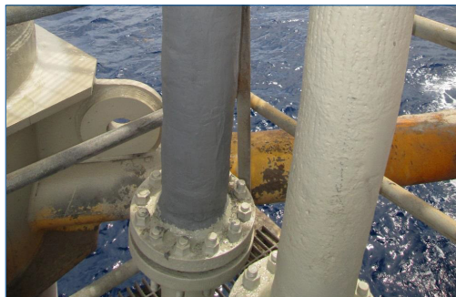
UV-resistant top coat applied