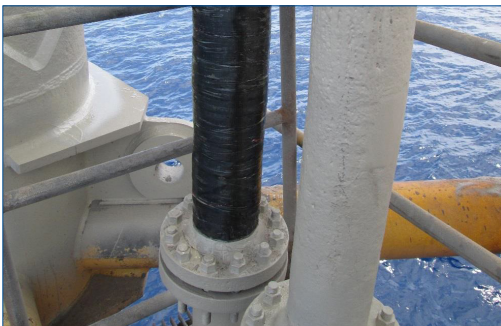
Belzona SuperWrap II applied