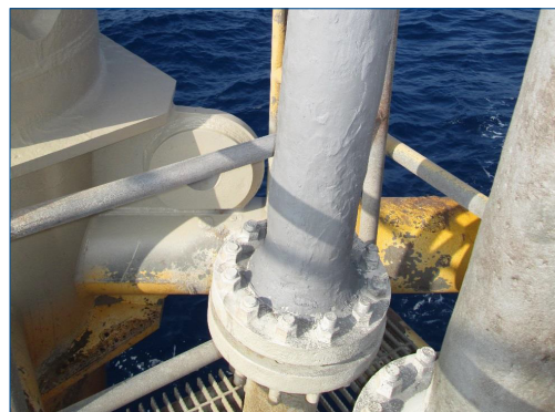
Pits filled and wall thickness restored