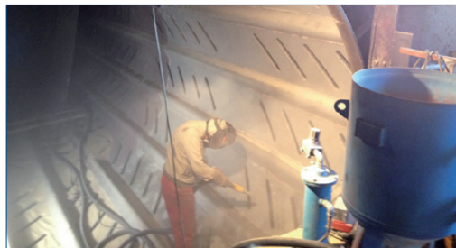
Grit blasting the de-barker drum

resistant characteristics, alleviating the issues it had been facing.