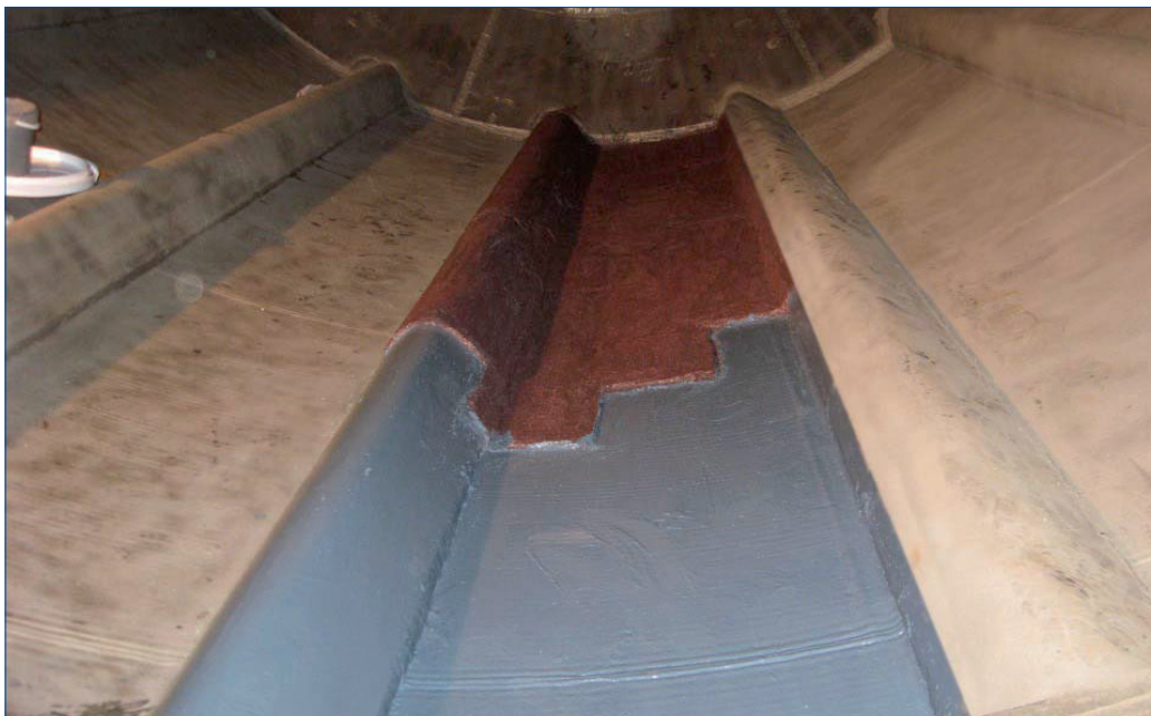
Application of Belzona 1321 (in grey) and Belzona 1811 (in red)

Due to the scale of the de-barker, which measured 10m (33ft) in length and 3.9m (13ft) in diameter, the paper mill was impressed that the application was completed within the designated timeframe so quickly and effectively. Pleased with the result, Stora Enso commented "The application on the dry and wet sections of the de-barker was good quality and completed on time. We recommend Belzona technology as a high quality and durable solution"