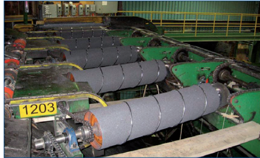
Grip system applied to transfer rolls at lumber mill

Belzona provide solutions to many of the problems related to storage and moving of the chips. With a versatile product range specifically designed to repair and prevent various abrasive wear conditions, Belzona has become the solution of choice for many pulp and paper plants where abrasion is an issue.