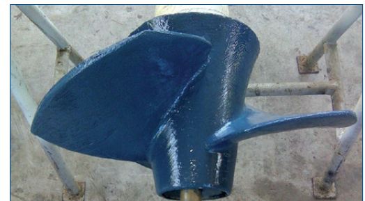
Recoated for future service in sludge

For more information, please contact your local Belzona representative: