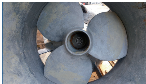
Components still excellent six years on

This polymeric solution continued to extend the pump's in service life further, saving the company significant replacement costs. The client expressed their satisfaction that their maintenance costs were reduced and the equipment was protected in the long term against the dangers of erosion-corrosion.