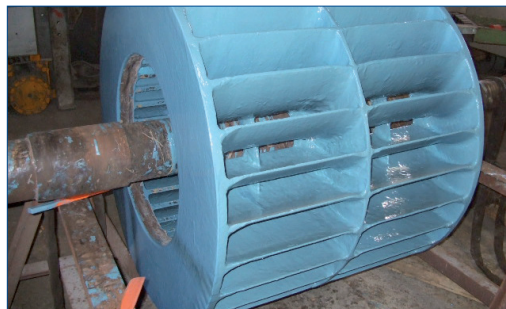
Vacuum pump protected against corrosion

Severely damaged equipment, such as diffusers, rotary vacuum washers or liquid ring vacuum pumps, can be restored to their original profile and protected from deterioration using our range of epoxy repair materials and coatings. Belzona's cold-applied, paste-grade, metal repair composites, such as Belzona 1111 (Super Metal), can be used to repair cracked and holed pumps, providing outstanding chemical resistance.