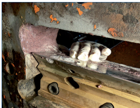
Chipper disk pocket rebuilt with Belzona