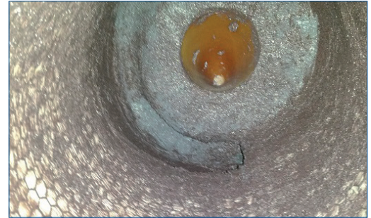
Abrasion resistant system incorporating tiles

Incorporating ceramic aggregates prevents deformation and wear, providing long-term protection. To increase equipment life, wear resistant alumina tiles can be bonded and grouted in place to create a hard wearing, extremely abrasion resistant lining.