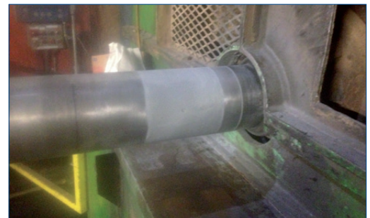
Shaft repair on chipper disk

Worn and damaged shafts can be repaired in situ, limiting the downtime and lost production costs which can be incurred. Bearing housings can be repaired utilising our erosion and corrosion resistant metal repair materials, which provide solutions that can extend the lifetime of equipment and return machinery to service in a fraction of the time. Dryer cans prone to leaks and steam loss can be also refurbished with Belzona metal repair composites and epoxy coatings.