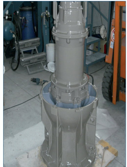
Pump originally coated in 2010

Originally coated in 2010 with Belzona, six years later the customer opened the pump for mechanical maintenance. Throughout its six-year service life, the pump faced zero downtime due to Belzona erosion-corrosion protection and, impressively, the coating was found to be in excellent condition. However, it was decided to refresh the coatings in order to prepare the pump for more years of service in sludge; therefore, the original coating was roughened before applying a new layer on top.