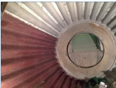
Abrasion resistant lining on de-barker

Pockets can be reformed using a 100% solids Belzona 1000 Series material, to create a perfectly mated profile. Future corrosion issues will be eliminated making the recurrence of worn knife pocket profiles unlikely.