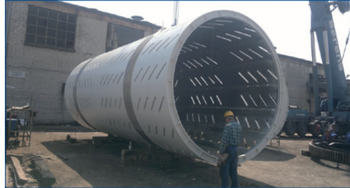
Each drum measured 10m in diameter

Upon selection, the work was performed over the course of six days, including full surface preparation of both the wet and dry drum by grit blasting. Initially, the steel drums were coated using Belzona 1321 (Ceramic S-Metal), a ceramic filled epoxy coating, designed to combat highly corrosive environments. Additionally, a protective barrier of Belzona 1811 (Ceramic Carbide) was applied. Incorporating abrasion resistant ceramic aggregates, this system was chosen to provide the de-barker with long-term wear and abrasion