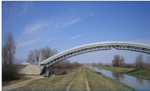
General view of pipe bridge

The client decided that a Belzona plate bonding application using Belzona 1111 (Super Metal) was the best solution as it would provide a high strength bond and, at the same time, eliminate the need for hot work allowing the application to progress without disrupting the gas supply.