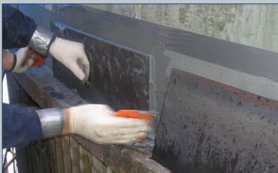
Tank base repair