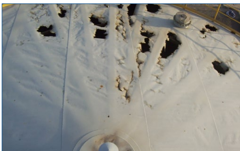
Holed tank roof

Residual stresses caused by uneven expansion-contraction change the structure and the properties of the metal and can lead to potential material degradation. ▶▶