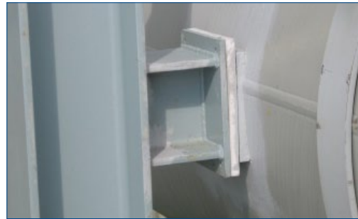
Completed sliding support in place