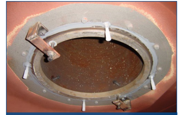
Rudder bearing installation