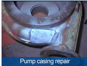
Pump casing repair