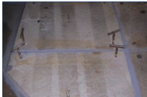
Plates bonded onto the deck