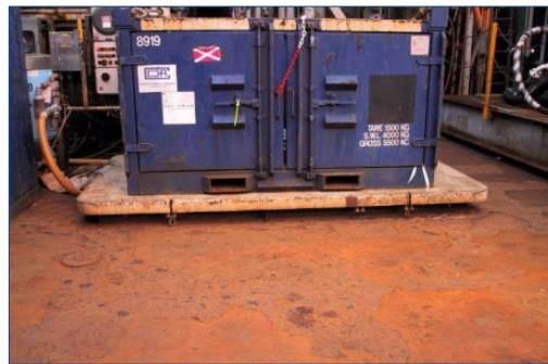
Corroded platform deck

Independent testing showed that the Belzona bonding method in this case was equivalent in strength to a welded plate. Very good resistance to impact loading was achieved and considered by the independent engineering designers to be "robust enough to withstand the rigours of the laydown area operations". Daily operations were not interrupted and the passive fire protection in the machinery space below was not affected. This work has been inspected annually and now, almost 10 years on, is still in perfect condition. ■