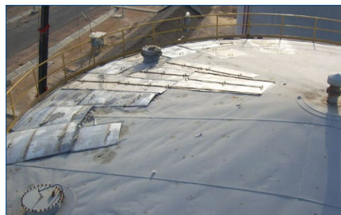
Plates bonded with Belzona