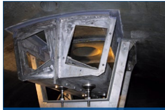
Process vessel internals bonding