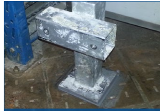
Load bearing shim creation