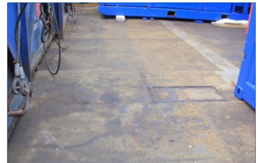
Deck inspected in 2012, 8 years later after application: Belzona plate bonding solution in excellent condition