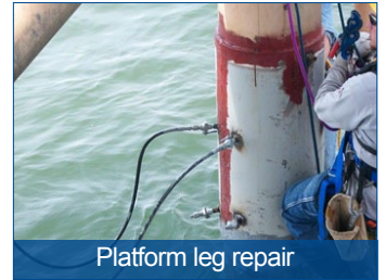
Platform leg repair

» Voids and porosity may also occur during the welding process. These can weaken the weld joint if not repaired, and can be difficult to detect if they are not visible on the surface of the weld.