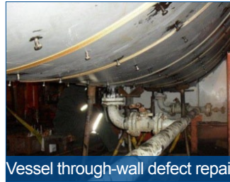
Vessel through-wall defect repair