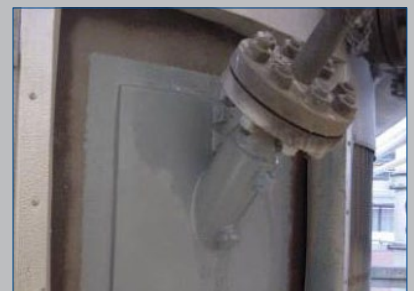
Cold bonded plate reinforcement