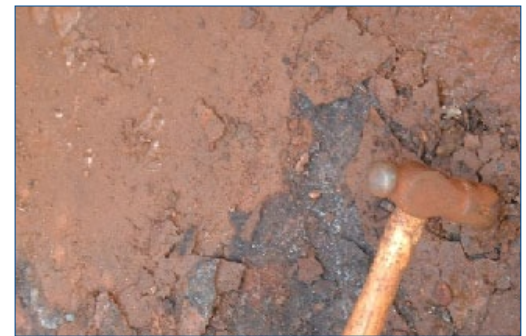
Close up: corroded platform deck