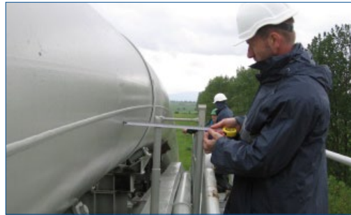
Preparing/measuring location for supports

Until today, the application is in perfect condition and, thanks to this success, four additional bridges have had supports bonded with Belzona so far. ■