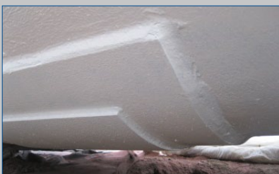
Pipe wear pads bonding