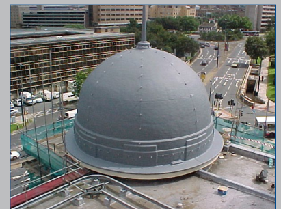
Follows complex contours

With its ability to provide impermeability to liquids, but permeability to water vapor - allowing the roof to breathe - this product offers a solution to roof leaks.