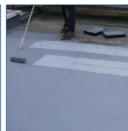
Easily applied by brush or roller