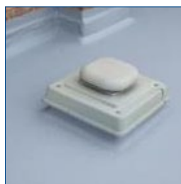
Remains flexible in service