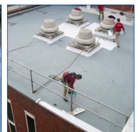
Belzona 3111 application in progress