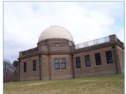
Application revisited in 2010