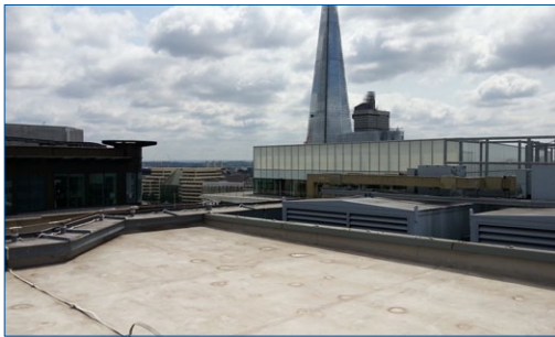
Roof cleaned and prepared

The client expressed themselves thoroughly satisfied with the application. The Project Co-ordinator said, "The contractors who carried out the works did a great job in a professional manner and we experienced no interruptions to business or complaints throughout the entire project." He further added, "I will definitely be recommending Belzona in any future projects where their system can be utilised." ■