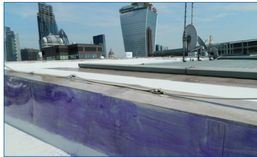
Surface conditioned to ensure good adhesion