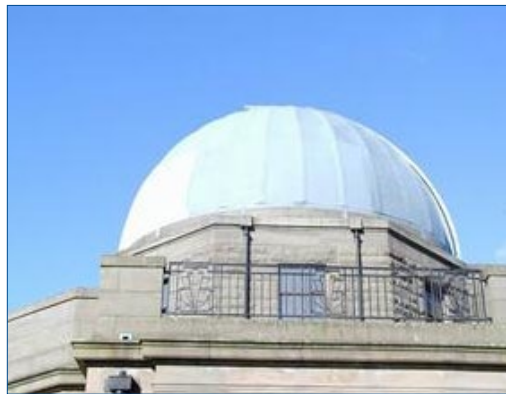
Refurbishment in 2003