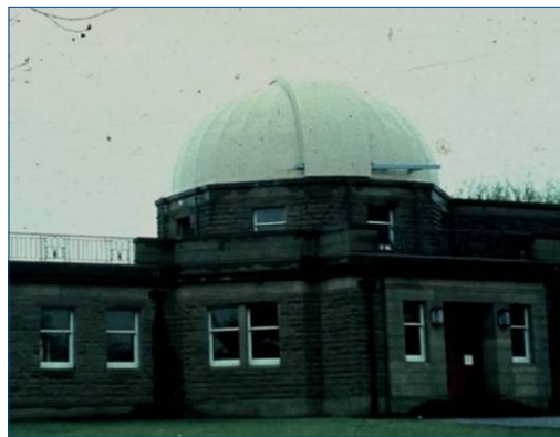
Original application in 1974

Following a recent visit, the dome was found to be in perfect condition and continues to uphold exceptional weatherproofing protection. ■