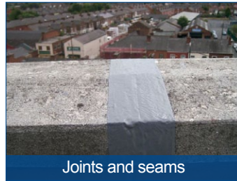
Joints and seams