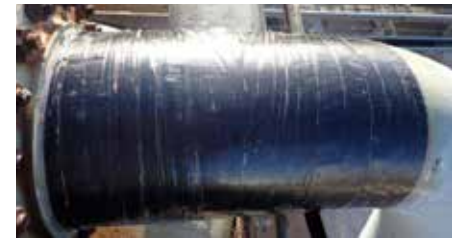
6. Inspection and Full Service