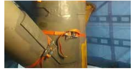
3. Rebuild and Repair