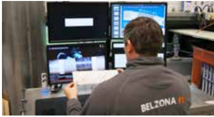
1. Design and Resin Selection