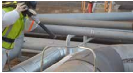
2. Surface Preparation