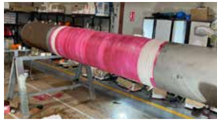
5. Consolidation and Cure