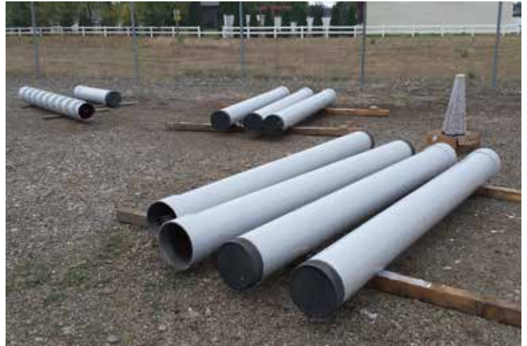
Belzona 5811DW2 used for 40-year-old irrigation pump

Spray- or brush-applied onto metallic surfaces, concrete, brick and others. Cures in low-temperature and damp conditions.