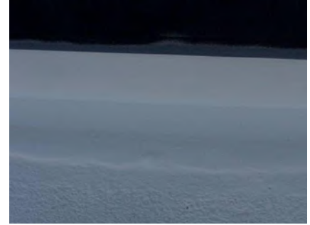
Final tank base application