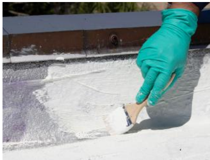
Mesh being applied over joint