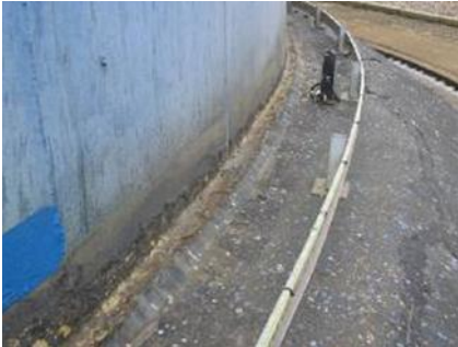
Concrete deterioration leading to water ingress