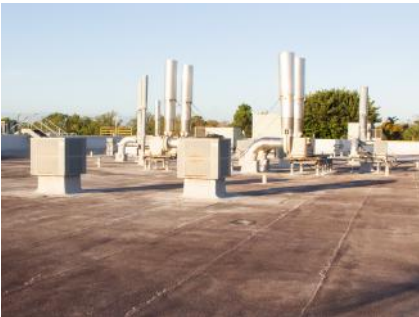
Roof before product application