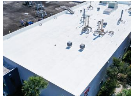
Final roof application