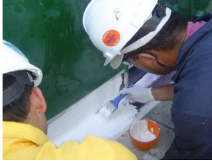
Applying first coat of Belzona 3111