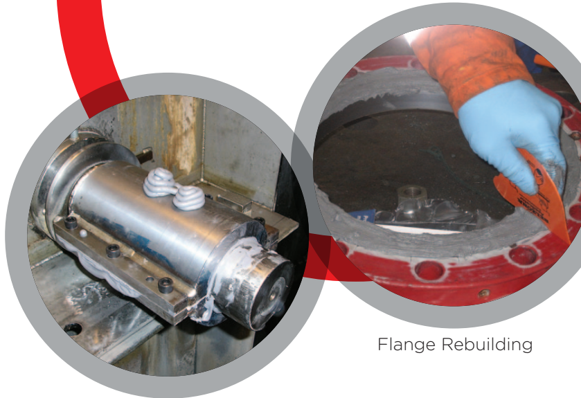
In-situ Shaft Forming