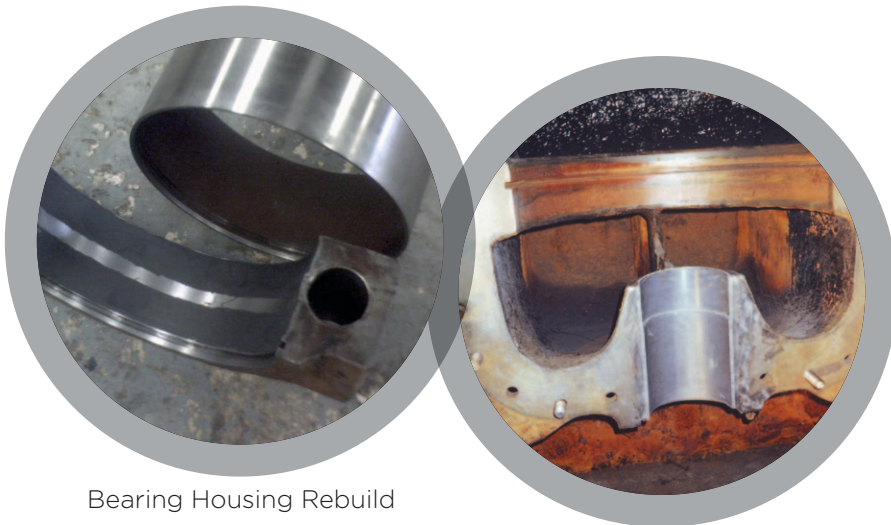
Bearing Housing Rebuild