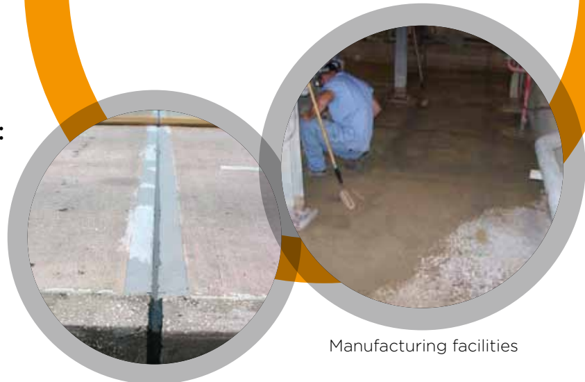
Bridges & roadways